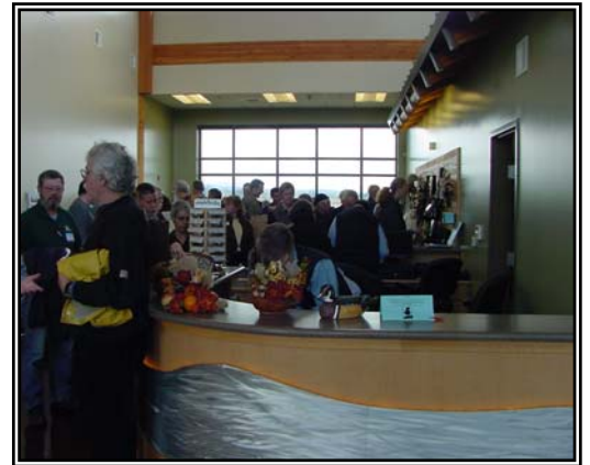
A Busy Opening for Nature's Outlook