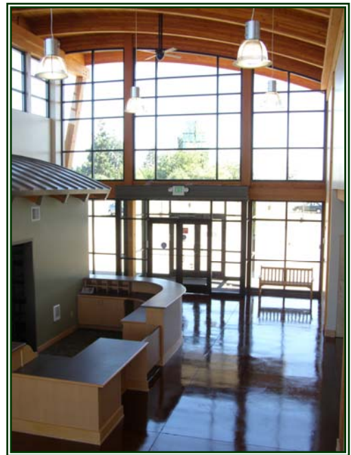
Interior of Wildlife Center

The date is set and plans are well underway. The Wildlife Center Dedication will be held Saturday March 29th. An opening ceremony with guest speakers will begin at 11:30 a.m. at the Refuge Headquarters. Following a ribbon cutting will be a day of hands-on activities, guided nature walks, and a chance to explore the Wildlife Center.