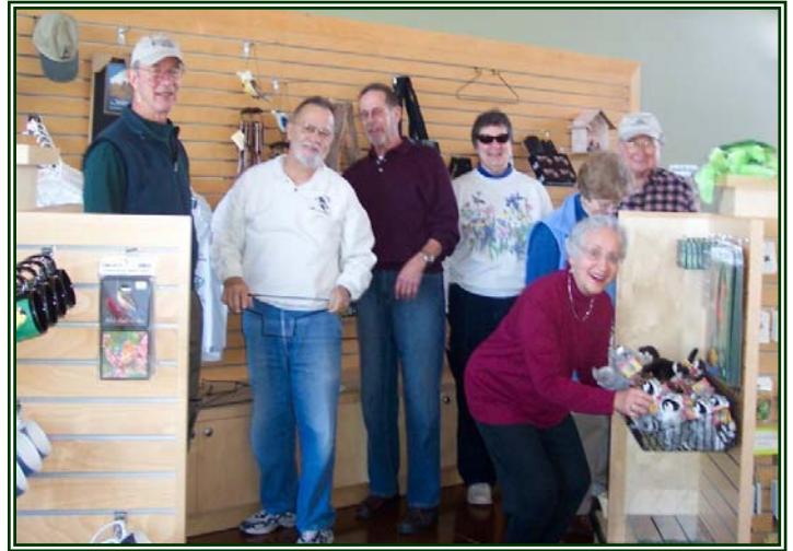
Nature's Overlook Store Committee

We also want to thank all of the members who purchased items during the store opening. Thank you for supporting the Friends of the Refuge.