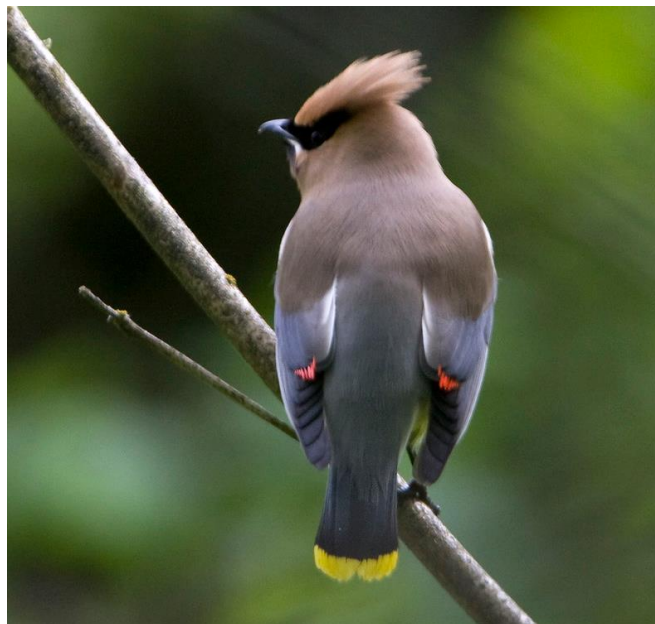
Figure 1: Cedar Waxwing Rick Leche, “Cedar Waxwing” 05/22/2008 Flickr, CC BY-NC-ND 4.0 https://creativecommons.org/licenses/by-nc-nd/4.0/

The Cedar Waxwing is a member of the waxwing family. A sleek bird with a large head, short neck, and short, wide bill, waxwings have a crest that often lies flat and droops over the back of the head. The Cedar Waxwing is a brown bird with a black mask bordered narrowly by white. It has yellow tips on the short square tail feathers, and red wax-like tips on secondary wing feathers (Figure 1). The purpose of the waxy red secretions—which gives them the name “waxwing”—is unknown. The belly is a pale yellow; under tail coverts are white. The Cedar Waxwing is smaller and browner than the Bohemian Waxwing and lacks the Bohemian's yellow wing spots. The Cedar Waxwing is usually seen in flocks, which sometimes number into the hundreds. Males and females generally look alike, with the exception of darker colored chins on the males. Cedar waxwings are 6 to 8 inches long with a 12-inch wingspan. Adults weigh about an ounce. Their flight is characteristically strong and undulating. Their long wings enable them to reach speeds up to 29 mph.