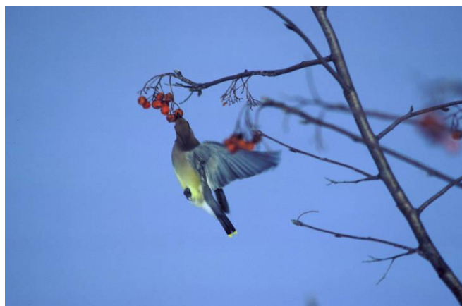
Figure 2: Cedar Waxwing feeding on berries.

The Cedar Waxwing mostly eats fruit (frugivorous). Most of its diet consists of berries, especially in the winter. Berries play a large role in the Cedar Waxwing's breeding, social and migratory behavior. Cedar Waxwings pluck berries while perching, hanging upside down, or briefly hovering in midair (Figure 2). Cedar Waxwings sometimes pass berries to one another as they perch in a line on a tree branch. The Cedar Waxwing also eats sap, flowers and insects. In the summer Cedar Waxwings may wait for an insect to fly by and then take off after it and catch it in the air. In the northern part of their range, cedar berries are an important food source. While most fruit-eating birds regurgitate seeds, Cedar Waxwings digest the entire fruit, and eventually disperse seeds in their feces. Occasionally they consume too much over ripened fruit, which may lead to intoxication and even death. Cedar Waxwings are often tame enough to feed near the feet of people.