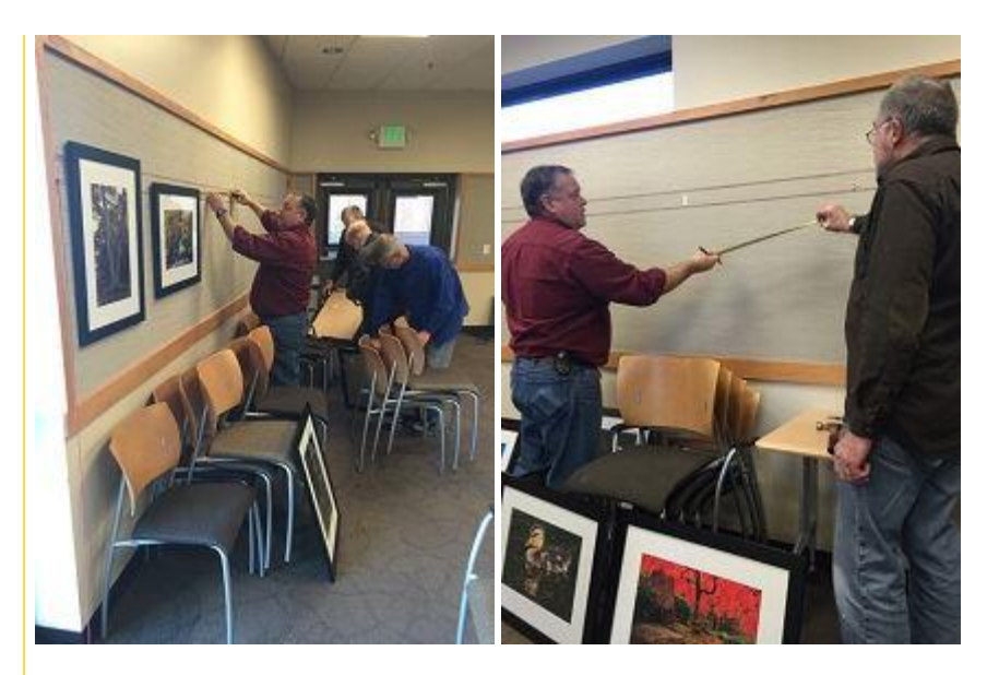
Categories for the show are: (all images must be made in Oregon/Washington)