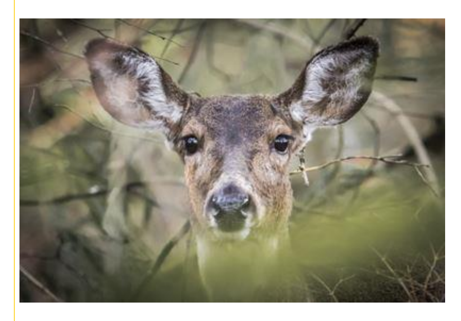
The show will remain on display into March when the Junior Duck Stamp exhibit will replace it.